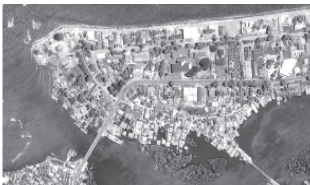
Band Aceh, June, 2004